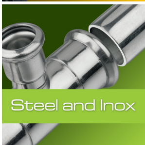
Steel and Inox