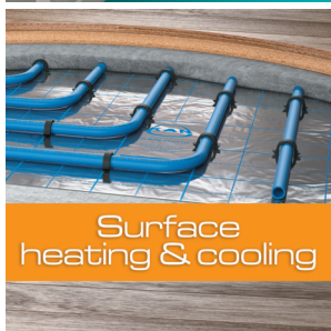
Surface heating & cooling

KAN was established in 1990 and has been implementing state of the art technologies in heating and water distribution solutions ever since.